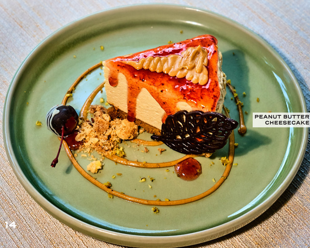
PEANUT BUTTER CHEESECAKE