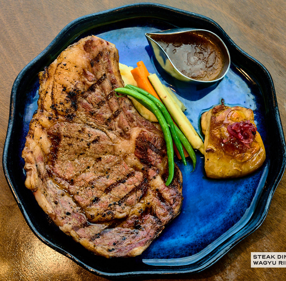
STEAK DINNER WAGYU RIBEYE