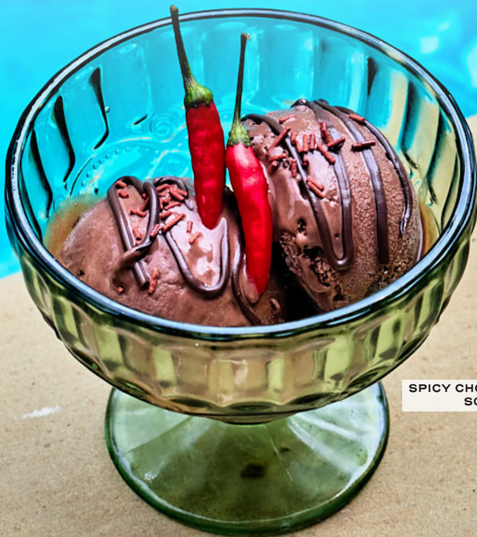
SPICY CHOCOLATE SORBETES